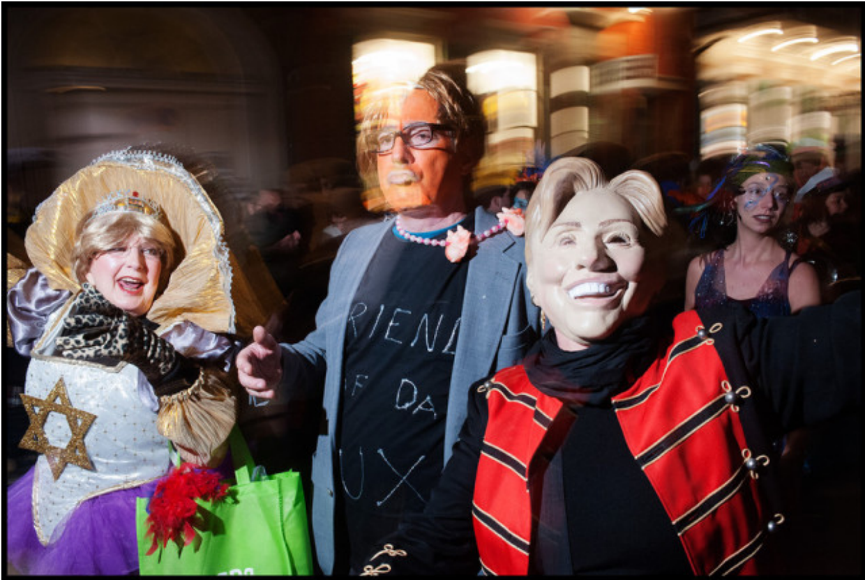
The Writer as Trump, Friend of da Jieuxs

But mocking Trump is just not enough. Things are just a tad too dire. Face it: one of two people has a non-zero chance of becoming the nation's 45th president. Neither is named Jill or Gary. Get over it. Given the peculiarities of American electoral politics, one of them is named Trump.