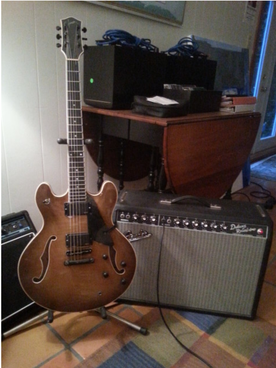
Everett F-85 and Fender Deluxe

Ain't no more favorite world than This Favorite World.