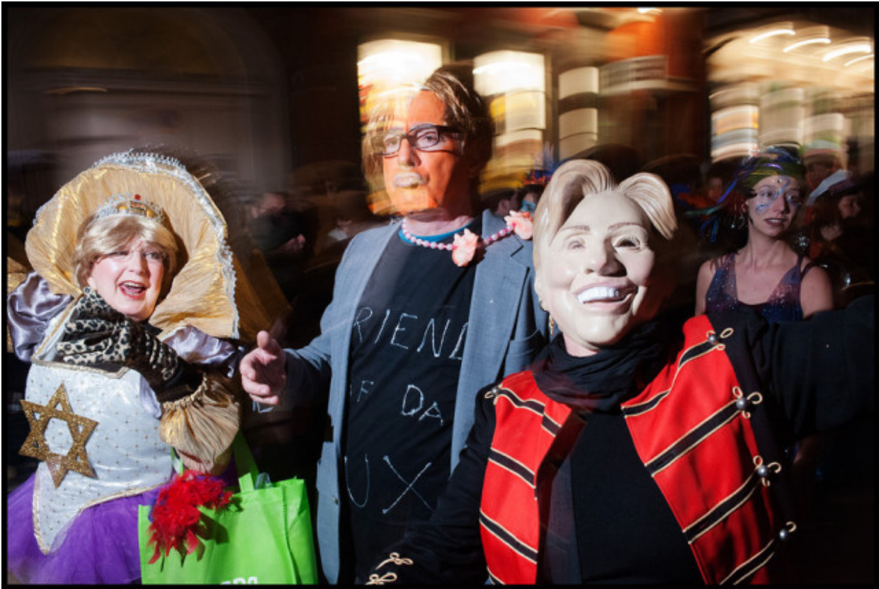
The Writer as Trump, Friend of da Jieuxs

But mocking Trump is just not enough. Things are just a tad too dire. Face it: one of two people has a non-zero chance of becoming the nation's 45th president. Neither is named Jill or Gary. Get over it. Given the peculiarities of American electoral politics, one of them is named Trump.