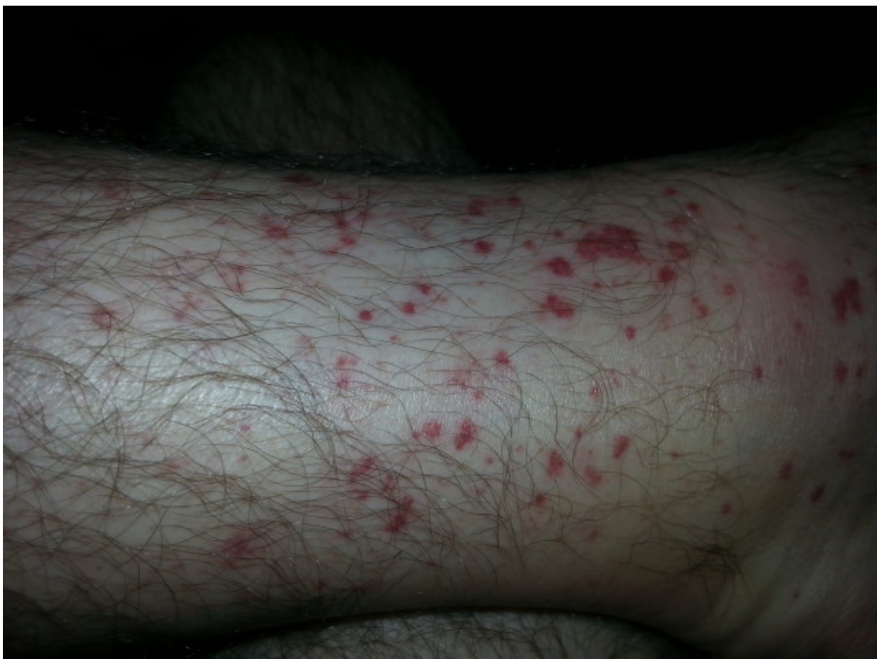
Petechial Rash – Very Nasty

Main reason this is My Favorite World? This: