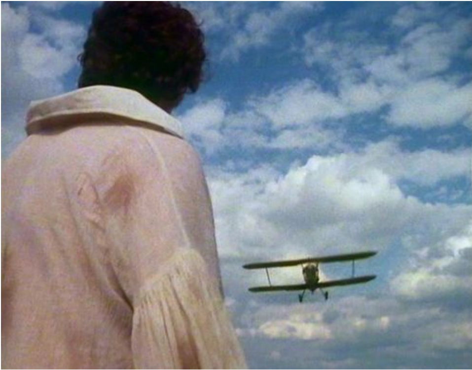
The fourth Doctor waiting for a plane

But forget all that. The thing that rang my bells with this viewing was the design sense of the movie. I grew up in the 70s and 80s, and there really has been no more dismal fashion era than that. Sure, we get a little campy buzz off of polyester bell bottoms in eye-popping colors, but nobody wants to dress like that.<fn>The less said about the teased-hair, shoulder-padded 80s the better.</fn> But that suit that Grant wears pretty much the entire movie? Good god, people...that is a piece of clothing!