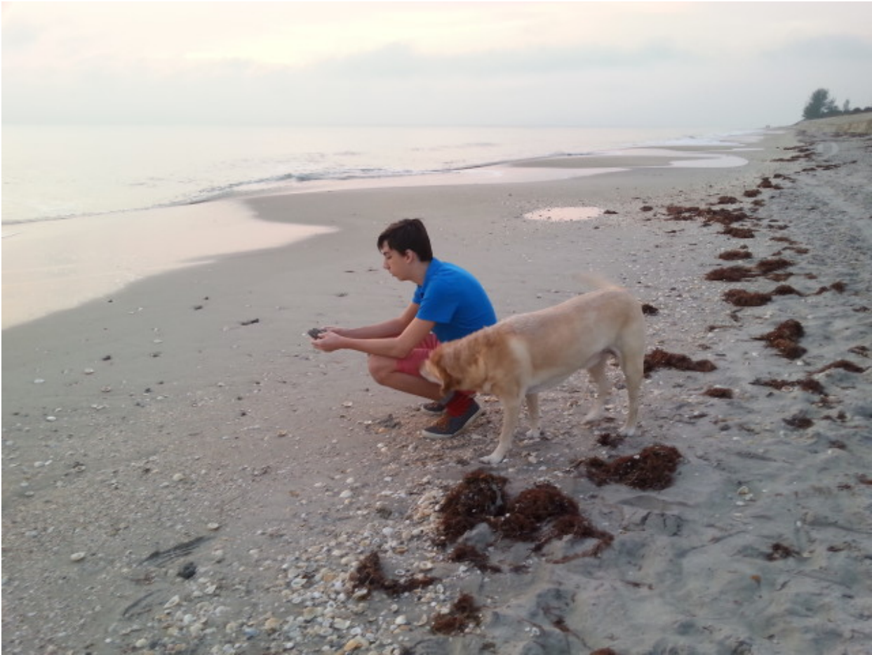
Son with photobombing hound

Alright, it's cloudy and I'm clearly the world's most annoying person. A wet and sandy hound named Andy has just assaulted us both. What could possibly make this post part of My Favorite World?