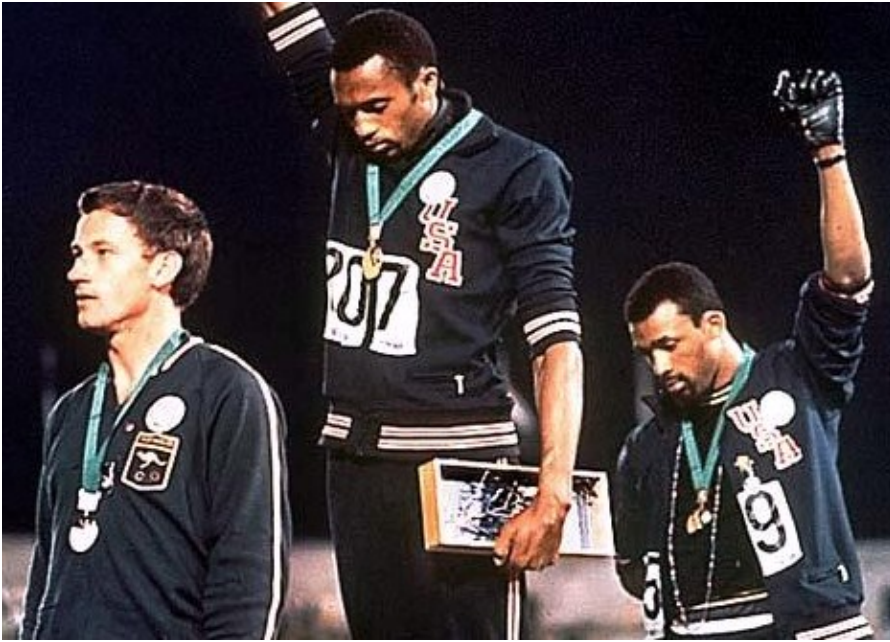
Tommie Smith and John Carlos – American Patriots

By the time I could pay attention, James Brown was the guy who made some of my favorite music, a thrilling force of nature.