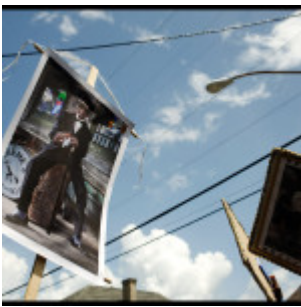
This cat knows how to captcha New Orleans.

Apologies for the radio silence, my multitudes. The Writer has been OCD-level consumed with an epic exploration of New Orleans/Mardi Gras/Musical Gumbo since September. It was supposed to be a nice, little article about one of my favorite NOLA bands, The Panorama Jazz Band. In the end...well, let's just say that it took on a momentum of its own and became something a wee bit more...involved. Story gone got hold my chicken wire, put the good foot pumping, let the voodoo loose with the boozy whoop and a fatmouth beer.