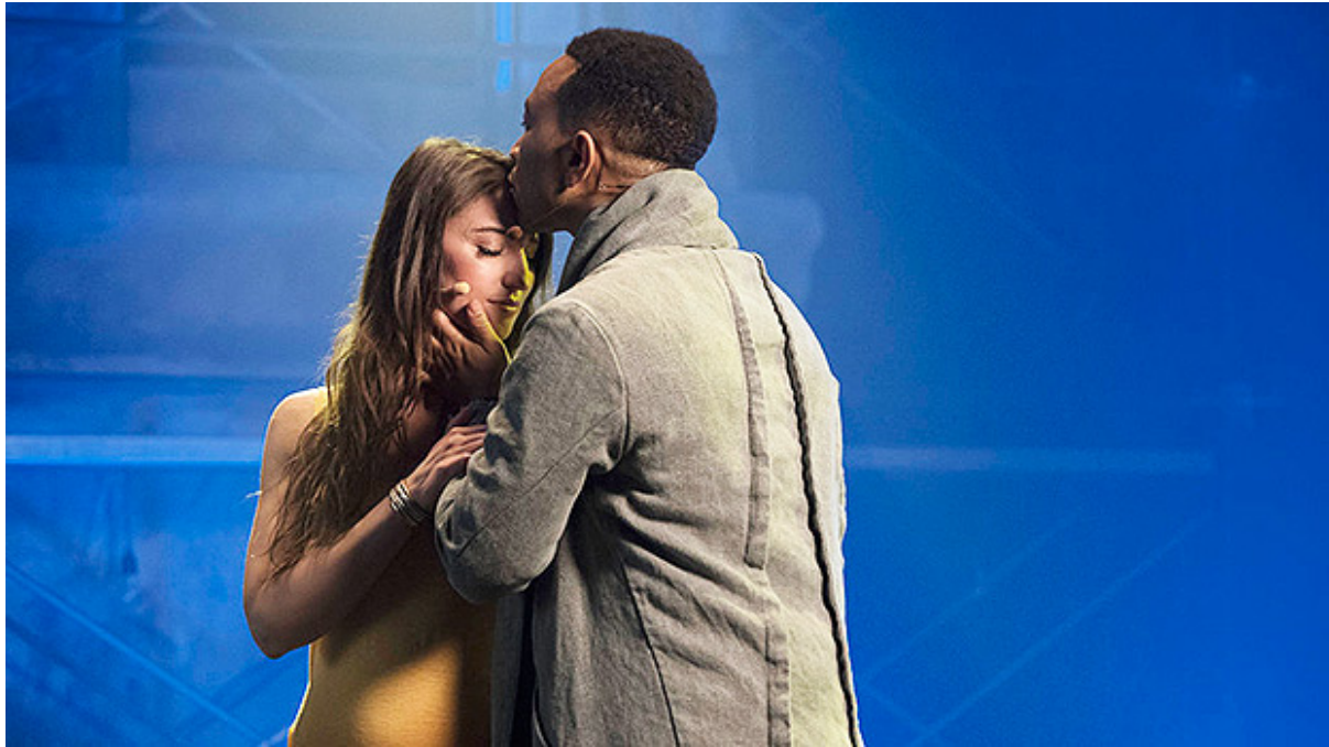
Sara Bareilles and John Legend as Mary and Jesus

The expected troll backlash from the religious right never really materialized. A fair number of theologically inclined folks complained that JCS does not include the actual stone-rolling-aside episode, a resurrection See what I did there? of a now 48-year old gripe, but it is hard to see that anyone thinks this production short-shrifted the Christ's ascension. Not to blow the suspense with spoilers, but there has never been a more effective evocation of the Crucifixion than this.