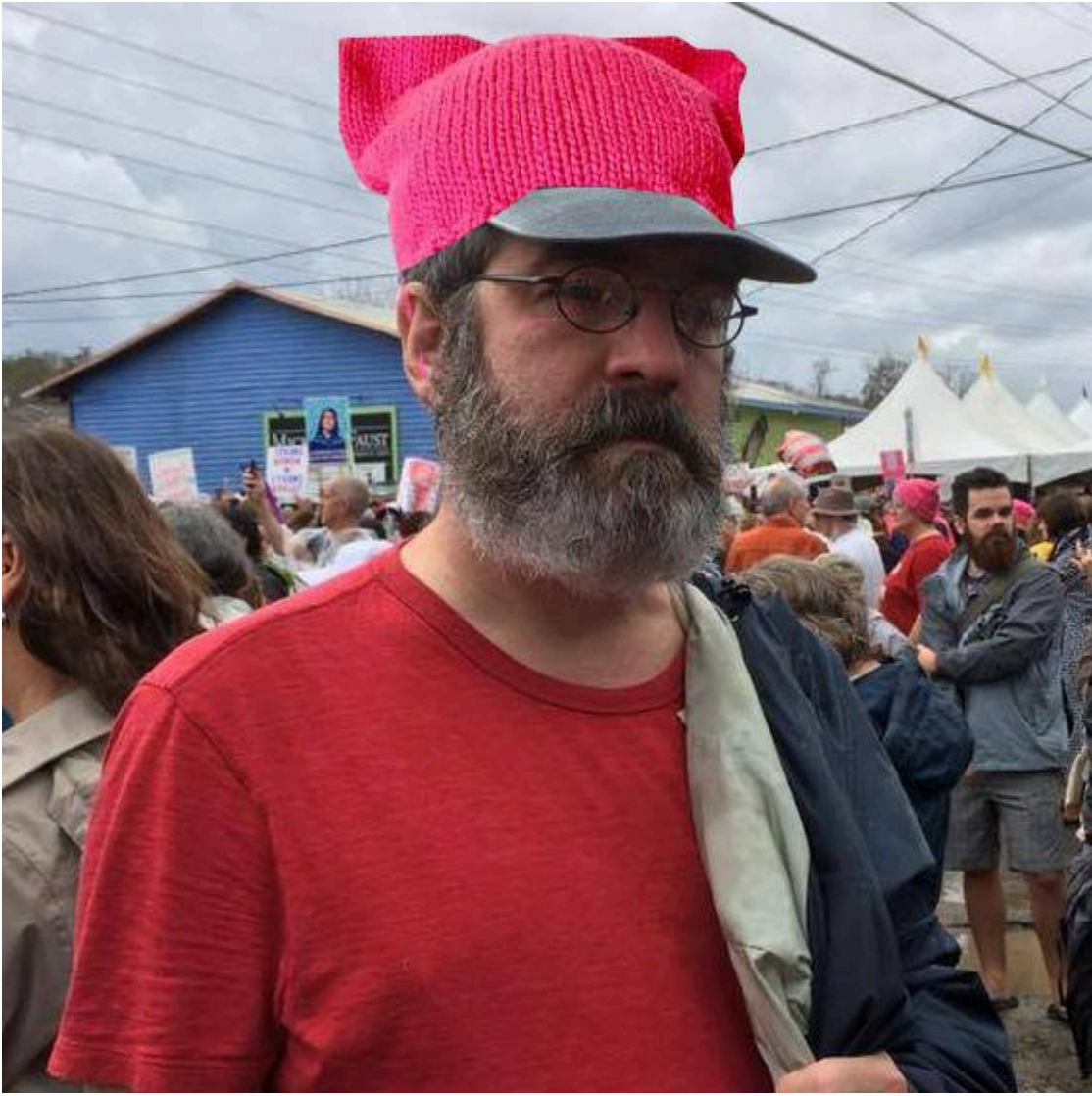
Old Goat as Pussy Warrior