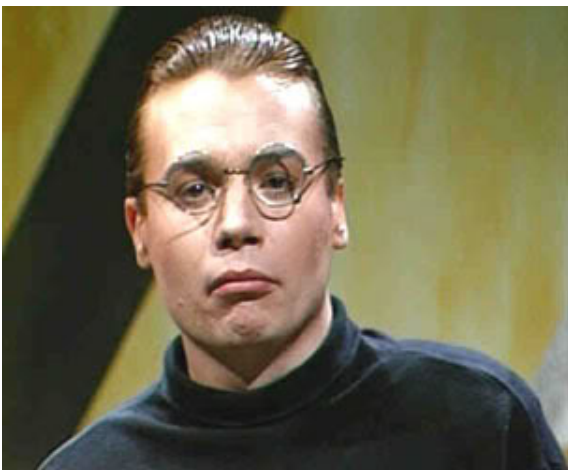
Welcome to Sprockets

The compound is claustrophobic and hallucinatory and really smacks of certain culti-ish mind control techniques. (The Heaven’s Gate crew comes to mind.) It also doubles as an all-encompassing art installation, with every detail carefully programmed by the Stenmark twins, who I visualized as Kraftwerk-ish euro hipsters, very thin, translucent, and dressed in all-black skin tights. Even when their clothing is described otherwise, they always look like Dieter to me.