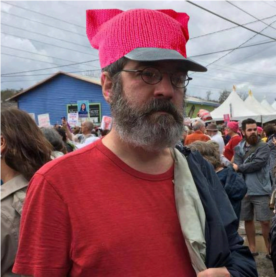
Old Goat as Pussy Warrior